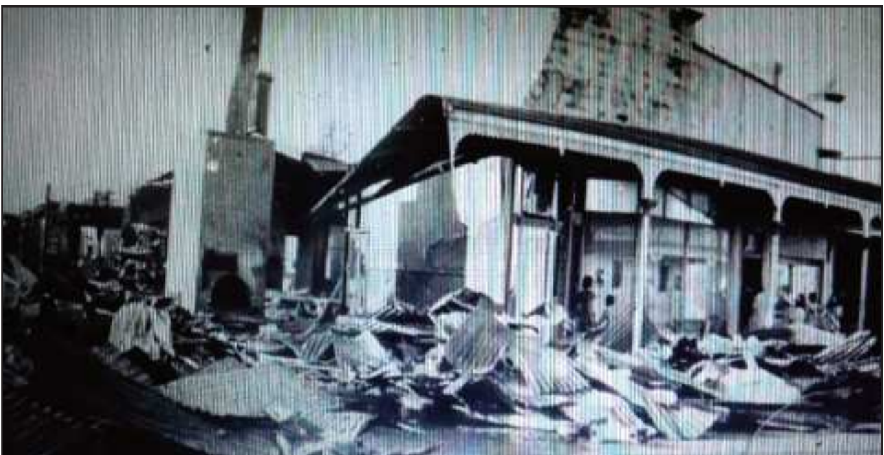
Remains of buildings in Minyip.