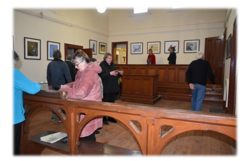
Charlton's Golden Grains Museum and Yeungroon Hall.